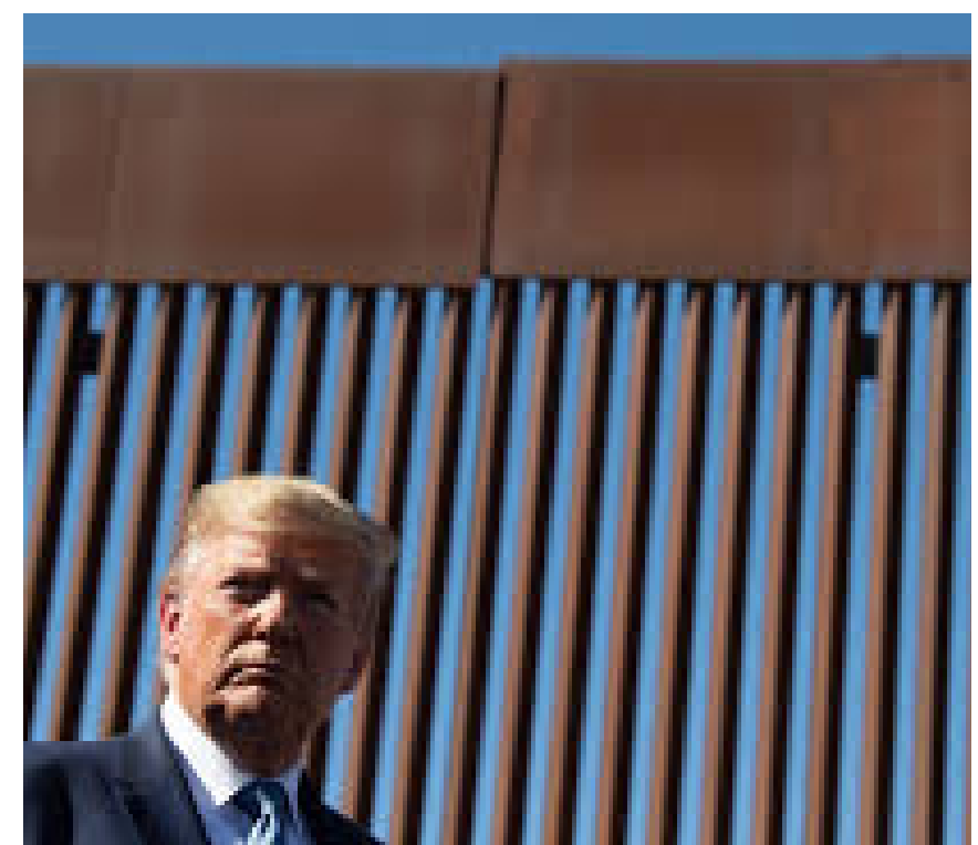
PRESIDENT TRUMP: The Donald stands proudly in front of his new Mexico wall.

it seemed to have struck a positive light on the presidency in a time that is much needed. The construction of the wall is scheduled to be completed in time for the rainy season. The Children's Daycare Society for Young Humans has volunteered to paint pretty flowers on the