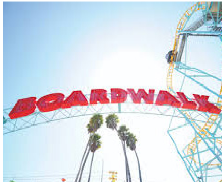
BOARDWALK: A popular destination for senior ditcher's on ditch day.

weren't able to see our teachers for nearly a month, and that was hard enough as is. Who wouldn't want to spend the entire day with your teachers after not seeing them for a month? These adults literally put their blood, sweat and tears into helping you finish your high school