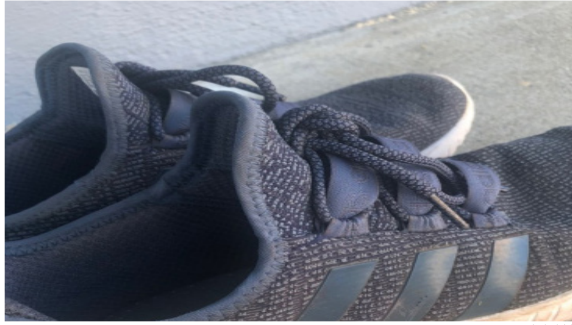
NEW CLASS: Sports education gives student-athletes an alternative to traditional PE classes.

C; +8:10= F. As you can see, there is no "D" in this class- you will either pass or fail the mile. Thankfully, though, this is only 15% of the students' overall grade. It will fall into its own category, though, which