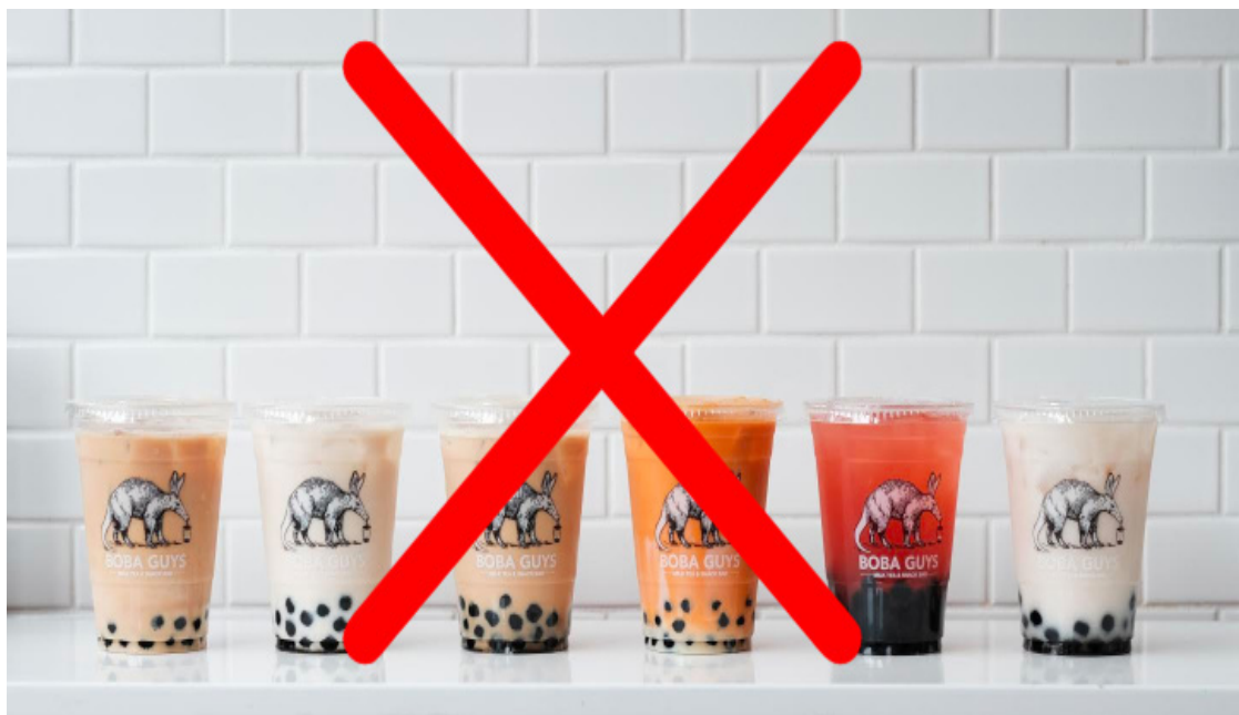
DANGER: Studies have shown that boba was deadlier than initially thought of.

Due to the mass amount of boba shops in Millbrae, its citizens are at an extreme risk for becoming ill. With that much exposure, all Millbrae citizens experience about an 80% higher risk in growing a tumor on any part of the body. "It's defi-