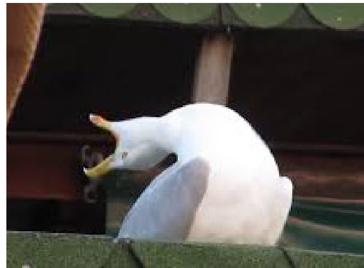
SEAGULL: Seagull seagull seagull seagull seagull seagull seagull.

However, it doesn't just stop there. Seagulls also poop everywhere and on everyone. Again, they don't discriminate, especially not when it comes to causing pandemonium and chaos. It's even theorized that seagulls intentionally target people when they fly through the air and let one drop. Seagulls are dedicated to making the daily lives of