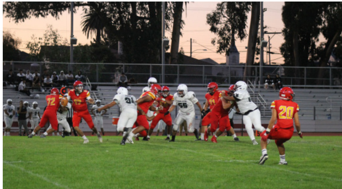
BANNED: Due to health concerns, the Mills PTO has decided to dismiss all contact sports.

flag football, capture the flag, tag, hopscotch, and hide & seek inspired by elementary students. Even though