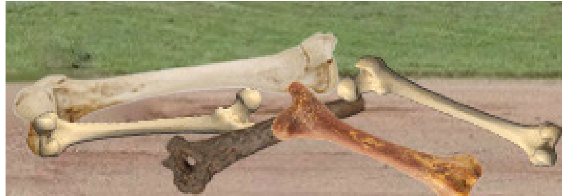
DISCOVERY: Bones discovered at the digging site are now under lab testing.WW