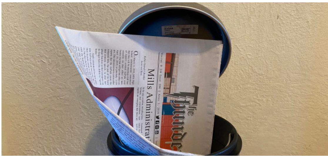
BACKLASH: The Thunderbolt reluctantly puts to rest its April Fools Edition.